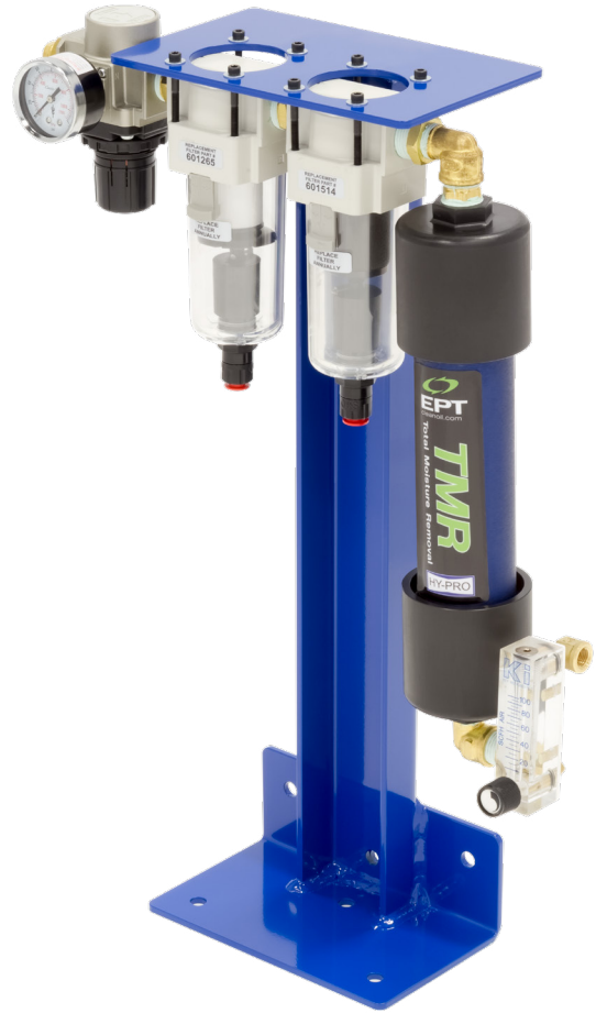
TMR ™ -Air Conditioned Reservoir

*TMR is a registered trademark of EPT CLEAN OIL.