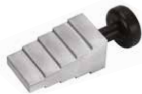
Aluminium Safety Block CY15B as option.