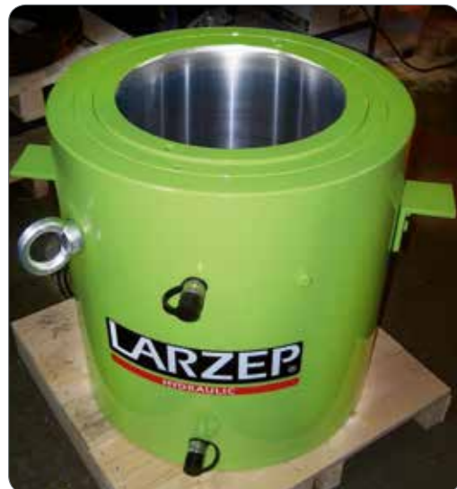
Larzep designs and manufactures special cylinders up to 1.000 Tn capacity to place load cells for pile testing applications.