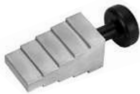
Aluminium Safety Block CY15B as option.